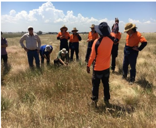
Paddock walk at Wurdi Youang