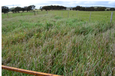
Example of practice area for sheep.

Part of the design aspect of the Stipa Multi Species cover cropping course is to determine the scale of a safe to fail trial. One of the Tatura participants was happy that we convinced him to reduce his first multi species cover crop from 400 ha to 100 ha.